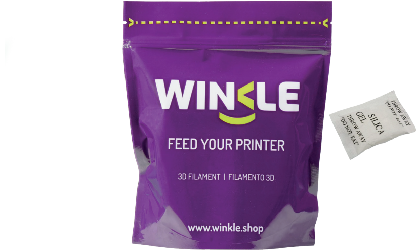
Reusable bag, spool and silica bag